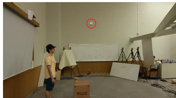
Fig. 2 Quadrotor tracking the person's face