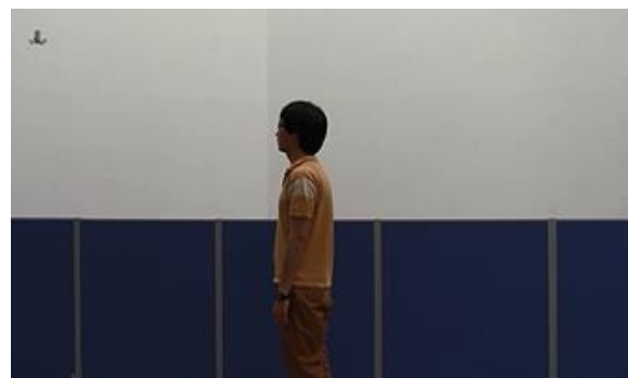
Fig. 2 Quadrotor tracking the person's face