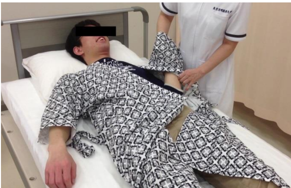
Fig. 1 Changing nightclothes

Keywords: nursing operation, education system, patient robot, different symptoms