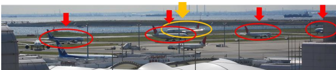
Fig. 1 Congestion at around 8:00 a.m. (five aircrafts are queuing up).

Keywords: Taxiing aircraft, easing congestion