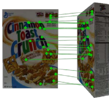
Figure 2: Before improving the viewpoint invariance of SIFT features.