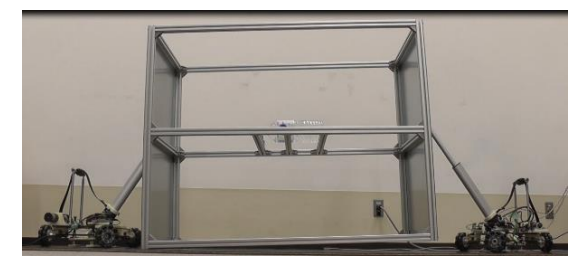
Fig 1. Developed mobile robot (above) and tilting manipulation using two mobile robots (bottom).