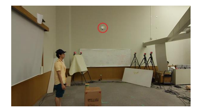
Fig. 2 Quadrotor tracking the person's face