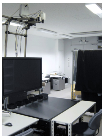
Fig. 2 Prototype Model