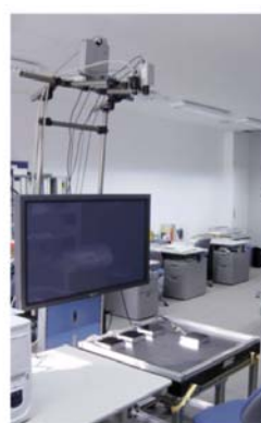
Fig. 2 Prototype Model