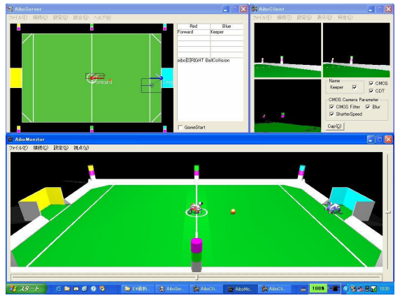
Fig. 2: Simulator